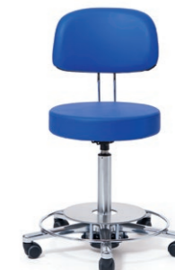
WORK CHAIR 51 - 71 cm. Item code 3045305 Foot release, backrest height adjustable, sitting cushion Ø 40 cm, cover in compact „Atoll“ C706, safety castors.