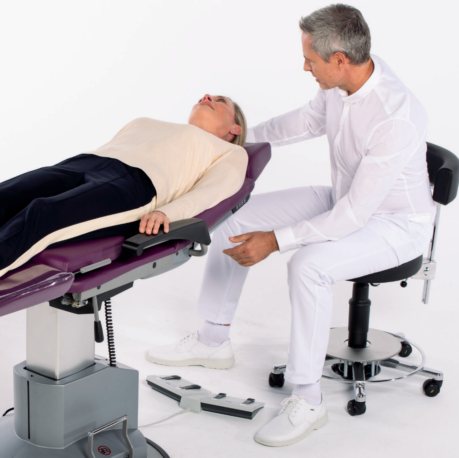
The examples shown here represent just a small selection out of the broad variety.

Let us offer you some inspiration: Here is a small selection from the GREINER work stools and chairs' product range. Stools without backrest, chairs with backrest in different designs. Height adjustment by hand or foot. Base parts and sitting heights of your choice. Upholstery materials in a wide variety of colours with compact or premium fabric. Or EL 11 equipment that is suitable for surgeries with electrically conductive components. The choice is yours.