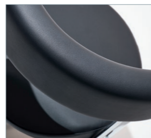
"Black" conductive cover, EL 11