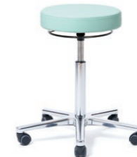
WORK STOOL 54 - 73 cm. Item code 3008305 5-star base polished, sitting cushion Ø 36 cm, cover in compact „Mint“ C450, 360° manual ring release, safety castors.