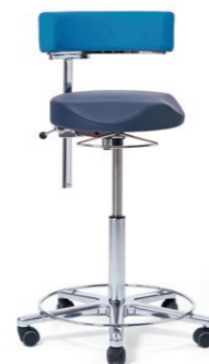
WORK CHAIR 54 - 73 cm. Item code 4185105 PREMIUM AS Chromed foot ring, swivelling crescent-shaped backrest height adjustable, anatomically shaped seat edge Ø 40 cm, cover in premium „Navy“ + „Aqua“ P710/700, manual height adjustment, safety castors.