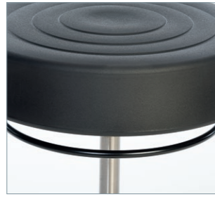
NexGen design and manual ring release