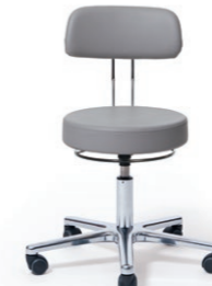
WORK CHAIR 40 - 52 cm. Item code 3018105 5-star base polished, small backrest height adjustable, sitting cushion Ø 36 cm, cover in compact „Stone“ C214, 360° manual ring release, safety castors.