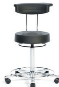
WORK CHAIR 54 - 73 cm. Item code 4019105 Chromed foot ring, full foam sitting cushion and crescent-shaped backrest, „Black“, 360° manual ring release, safety castors.