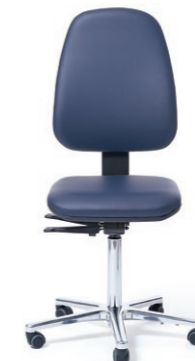
OFFICE CHAIR 54 - 73 cm. Item code 3054600 PREMIUM BS 5-star base polished, backrest adjustable in height and depth with dumping function, without armrest, cover in premium „Navy“ P710, safety castors.