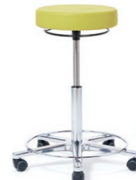
WORK STOOL 54 - 73 cm. Item code 3009105 Chromed foot ring, sitting cushion Ø 36 cm, cover in compact „Citron“ C500, 360° manual ring release, safety castors.