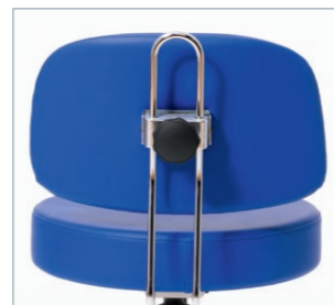
Large backrest from the rear