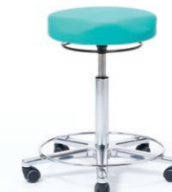
WORK STOOL 54 - 73 cm. Item code 4129105 Chromed foot ring, anatomically shaped seat edge Ø 40 cm, cover in compact „Cyan“ C422, 360° manual ring release, safety castors.