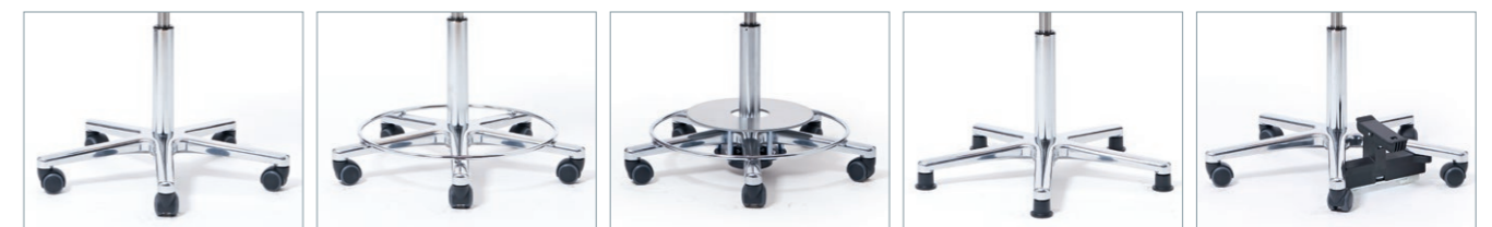
Manual ring release, 5-star base Manual ring release, foot ring Foot release with foot ring 5-star base with sliders Central arrest

This is what free choice looks like: The base parts of the GREINER work stools and chairs are characterised by their glossy design, quality and seating comfort. Otherwise, they are rather versatile and tailored to your needs. The foot release developed by GREINER, for example, offers high clinical added value wherever sterile or contaminated gloves are used. Triggered by the round pedal plate attached above the 5-star base, it can be operated "hands-free" all around. All work stools have safety castors, on request as an electrically conductive version.