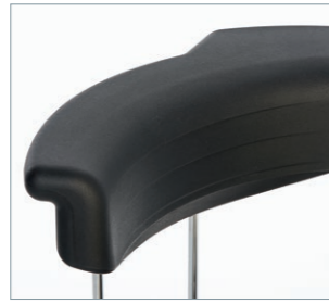
Crescent-shaped full foam backrest