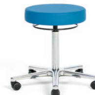
WORK STOOL 40 - 52 cm. Item code 4108105 PREMIUM HO 5-star base polished, sitting cushion Ø 40 cm, cover in premium „Aqua“ P700, 360° manual ring release, safety castors.