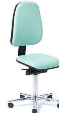
OFFICE CHAIR 54 - 73 cm. Item code 3054600 5-star base polished, backrest adjustable in height and depth with dumping function, without armrest, cover in compact „Mint“ C450, safety castors.