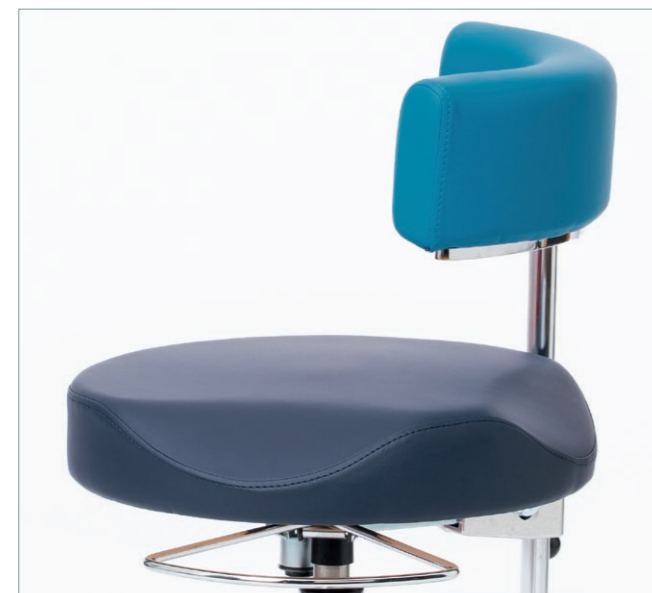
Fatigue-free operation thanks to support for arms or torso