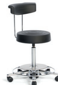
WORK CHAIR 51 - 71 cm. Item code 4015305 Foot release, full foam sitting cushion and crescent-shaped backrest, „Black“, safety castors.