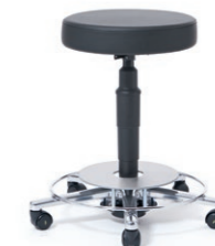
WORK STOOL 51 - 71 cm. Item code 4105305 EL 11 Foot release, sitting cushion Ø 40 cm, cover „Black“ EL 11, gas spring column and safety castors overall electrically conductive.