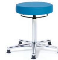
WORK STOOL 54 - 73 cm. Item code 4108305 RG 01 PREMIUM HO 5-star base polished with sliders, sitting cushion Ø 40 cm, cover in premium „Aqua“ P700, 360° manual ring release.