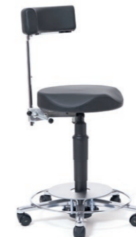
WORK CHAIR 51 - 71 cm. Item code 4185305 EL 11 Foot release, swivelling crescent-shaped backrest height adjustable, anatomically shaped seat edge Ø 40 cm, cover „Black“ EL 11, gas spring column and safety castors overall electrically conductive.