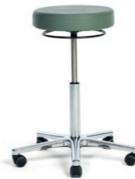
WORK STOOL 54 - 73 cm. Item code 3008305 5-star base polished, sitting cushion Ø 36 cm, cover in compact „Petrol“ C435, 360° manual ring release, safety castors.

Let us offer you some inspiration: Here is a small selection from the GREINER work stools and chairs' product range. Stools without backrest, chairs with backrest in different designs. Height adjustment by hand or foot. Base parts and sitting heights of your choice. Upholstery materials in a wide variety of colours with compact or premium fabric. Or EL 11 equipment that is suitable for surgeries with electrically conductive components. The choice is yours.