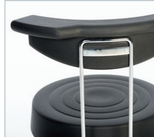
Modern design with high functionality