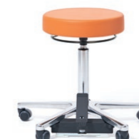
WORK STOOL 46 - 58 cm. Item code 3008205 CENTRAL 5-star base polished with central arrest, sitting cushion Ø 36 cm, cover in compact „Orange“ C530, 360° manual ring release.