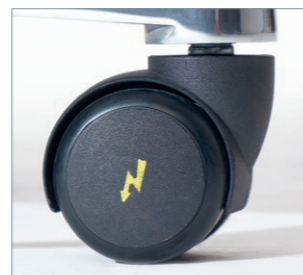
Electrically conductive safety castors, EL 11