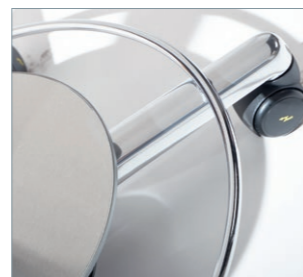
Foot release with foot ring