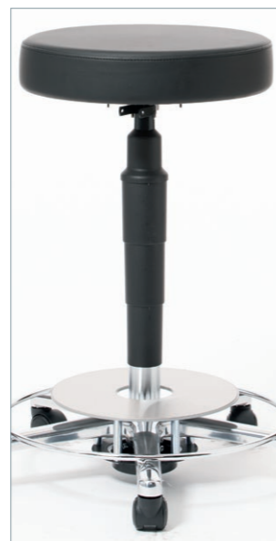
Surgery-compliant equipment EL 11 with electrical conductivity