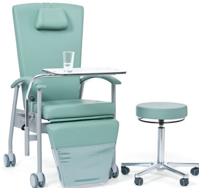
Versatile work stool that suits every treatment chair

Sit like a pro so you can work like a pro. Anatomy, ergonomics and functionality characterise the product design of GREINER's work stools and chairs. Modern sitting comfort not only stands for comfortable upholstery and backrests or smooth-running castors – every functional detail also contributes to an active and ergonomic sitting position.