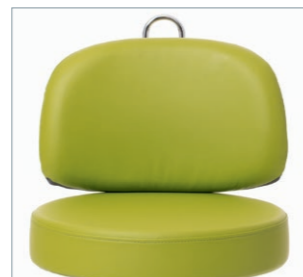
Large backrest front face